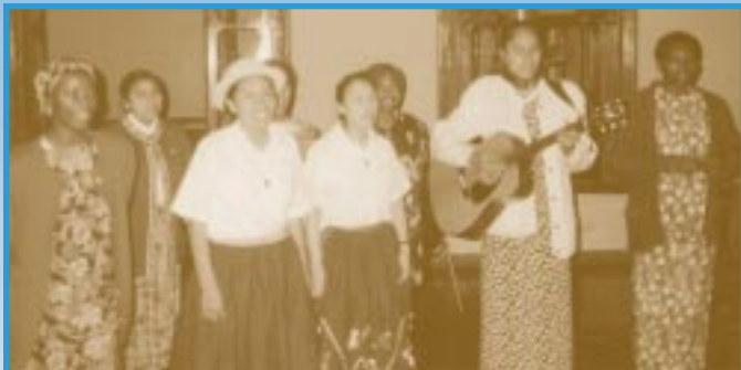
Carmelite Missionary Workers of the Immaculate in Lima, Peru.