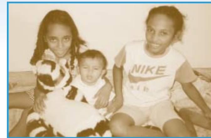
Orphans cared for by Carmelite Sisters, Brazil.

She rejoices with Him, that is also the consoling truth of her Assumption. The Blessed Virgin's being proclaims the greatness of the Lord, her spirit finds joy in God her Savior; He who is mighty has done great things for her in her Assumption. Mary's joy in her Lord is fulfilled. The Mighty One has indeed done great things for her, forevermore.