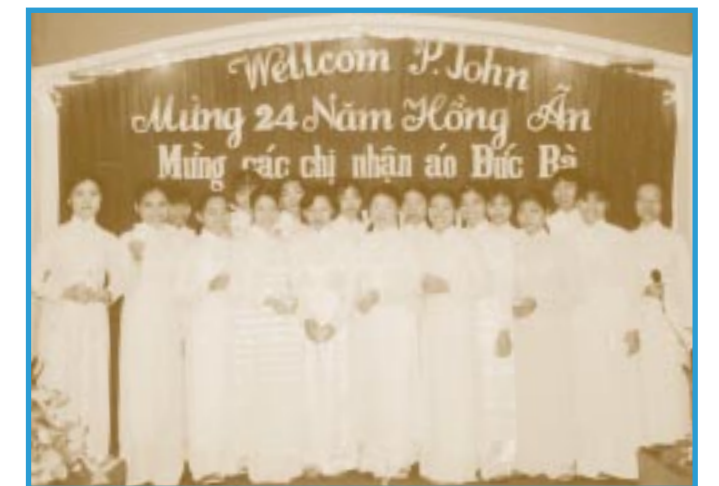
Young candidates to be Lay Carmelites in Ho Chi Minh City, Vietnam.

It is because Jesus has risen from the dead that Christians believe in the resurrection of the body and (continued on next page)