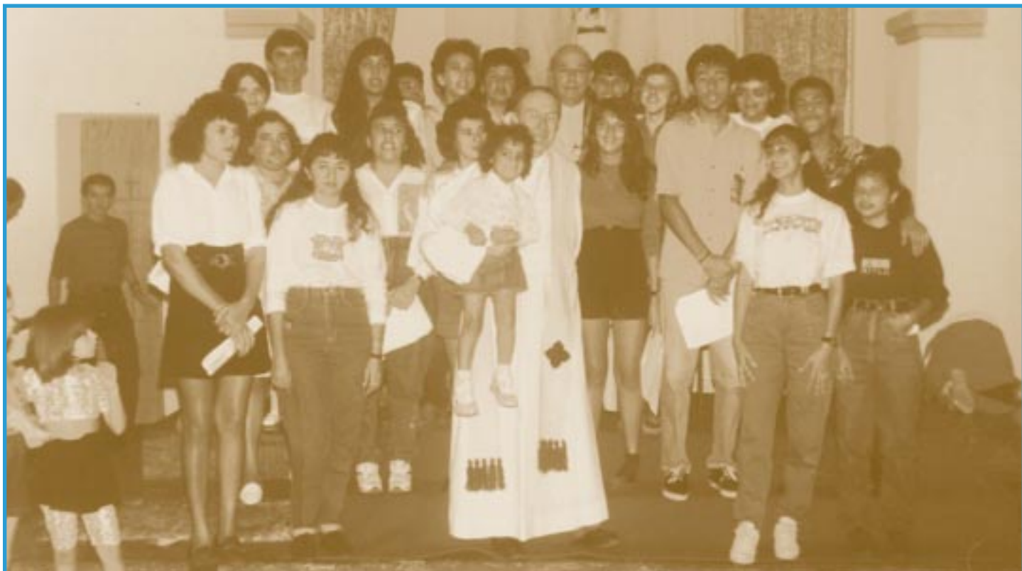
Carmelite Lay community in Buenos Aires, Argentina.

Father in heaven, all creation rightly gives you praise, for all life and holiness come from You. In the plan of your wisdom she who bore the Christ in her womb was raised in glory to be with Him in heaven. May we follow her example in reflecting your holiness and join in her hymn of endless life and praise. We ask this through Christ our Lord. Amen.