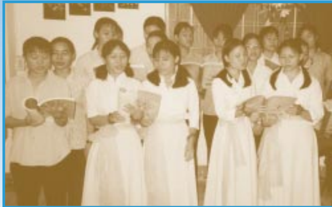
Parish choir of Lay Missionary Workers in Saigon.

Christian artists have always been fascinated by Our Lady. From the Gospel story of the Annunciation to the ancient feast of her Assumption, the Mother of Jesus has been a favorite subject of painters and sculptors.