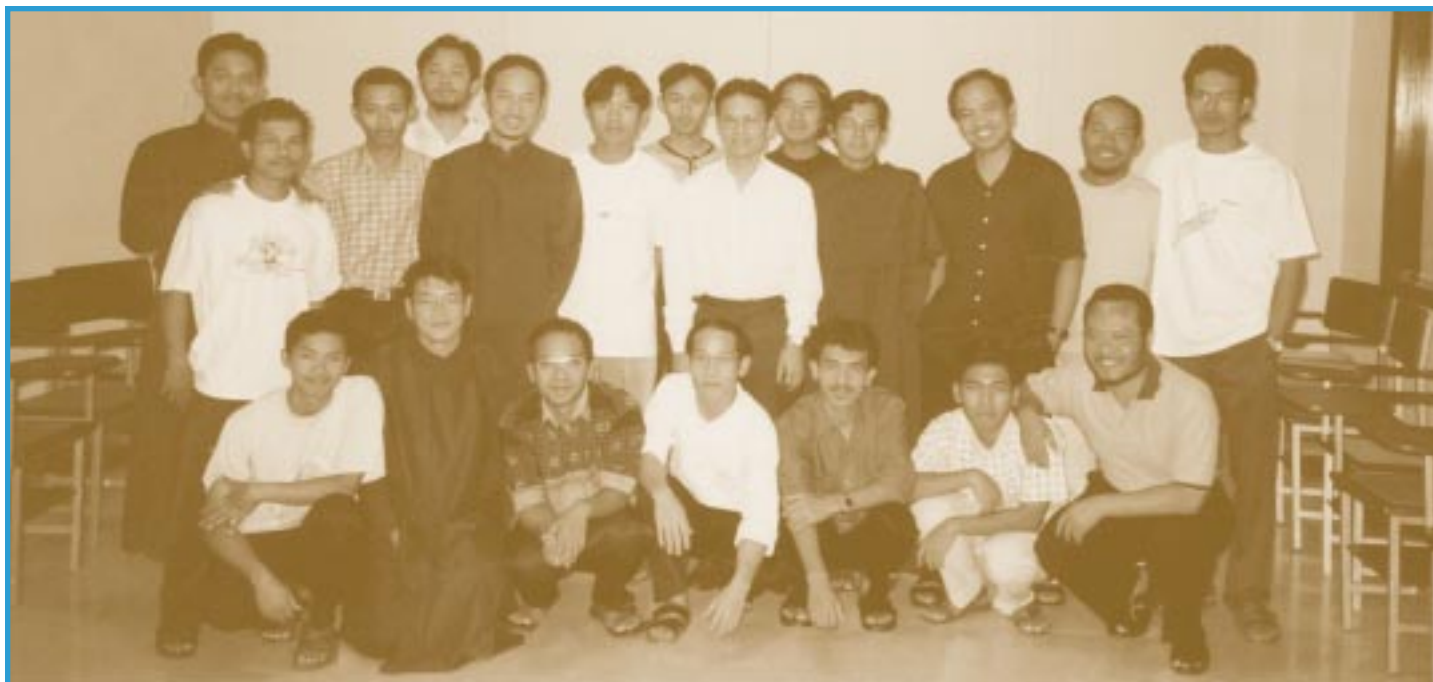
Theology students in Java, Indonesia.