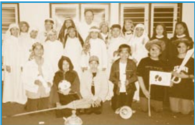
Daughters of Carmel in Indonesia – In Costume for a Play Presentation

Thomas was rather young when he died—only forty-nine at the time of his death on March 7, 1274. He was on his way to a Council of the Church in Lyons, France, and he got ill during his journey. He went to a Cistercian monastery in northern Italy to recuperate. He lingered for a while in feeble health, and during that time he honored a request of the monks to write a commentary on the Canticle of Canticles. This was his last work—he died with his pen in hand, seeking to work for God to his dying moment. He was later made Patron of Catholic schools. He is considered to be the source person of systematic theology. He influenced Catholic thought until modern times. Thomas loved God with all his heart and became a great saint—something that might have been impossible if he had followed instead the desires of his family to seek honors and an easy life in special Church positions.