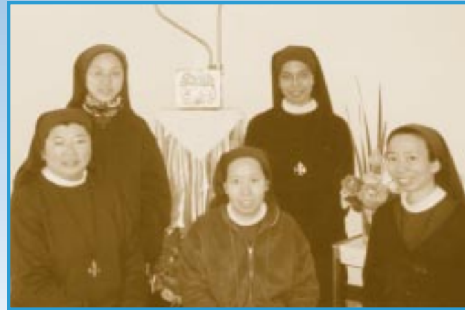
Potential Missionaries for China – Daughters of Carmel

But some troubles ensued, and when he was ten, he was taken out and sent to the newly founded university in Naples. He was a quiet boy, and hardly spoke to a soul. As he grew older, he became quite tall and very fat. Probably his taciturn nature and his size prompted his classmates to call him a Dumb Ox! In any case, his stay in Naples helped him to find his future.