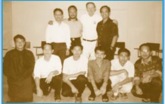
Seminarians in Malang, Indonesia

Thomas was up early in the morning, and he would say his morning prayers and celebrate Mass, and then attend another Mass in thanksgiving. His work-day was one of study, teaching, writing, and giving advice to the great ones of the world...and often to the humble as well. The key to his life was his great devotion to the