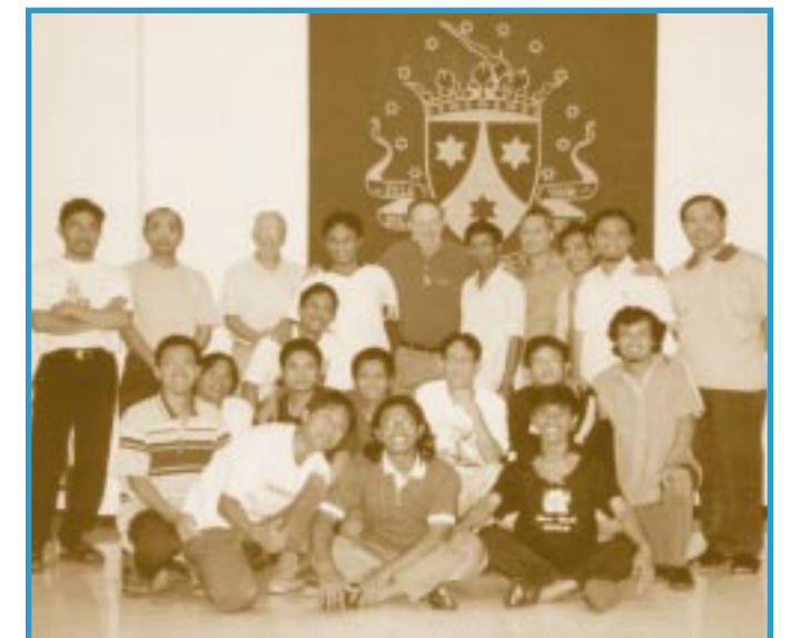
Theology Students in Indonesia – Candidates for China