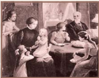
Portrait of the Martin family