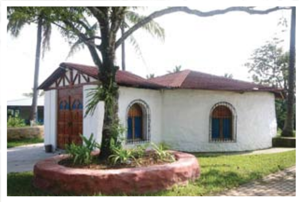
Xiberta Formation Center - Encouragement and Hope for Seminarians

Your prayers and your support are needed NOW more than ever.