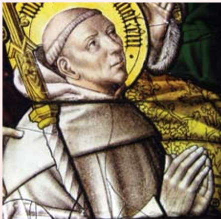
Saint Bernard of Clairvaux, c. 1505-8.

The Trappists are noted for their very strict monasticism. Until the Second Vatican Council suggested a few modifications, they led a life that most found edifying – but forbidding. They never talked, never ate meat, fish, cheese, or eggs. They arose at 2 AM from a bed of boards and straw and spent their time in prayer and work. Some false information was spread about them: that they dug a shovel full of their grave each day. This was not true, but they were strict and austere. They are the disciples of St. Bernard. He did not found the Order, but he was its chief influence and best-known saint.