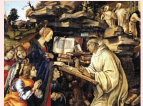
"The Apparation of the Virgin to Saint Bernard", by Filippino Lippi, c. 1486.

Bernard, however, did not rush to Cîteaux immediately. He did something that probably makes him eligible for the Guinness Book of Records. He was able to use his family home at Chatillon, and he first persuaded his uncle