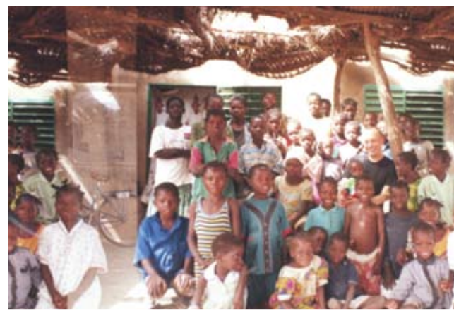
"Children helped by Carmelite Missions"

Your offering and your support are needed NOW more than ever.