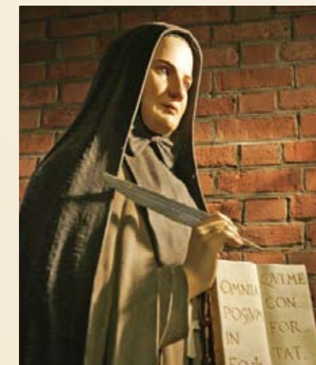
St. Frances Cabrini, founded the Missionary Sisters of the Sacred Heart (1880).

Mother Cabrini's deep trust in the loving care of God was contagious. It gave her Sisters strength and inspiration in doing the work of Christ. They begged most of the money to pay their bills and to care for the immigrants they were called to serve. Most of the money was donated by the immigrants themselves – poor people who often gave nickels and dimes to help people even poorer than themselves. A story with an amusing twist is told that in one Chicago jail the prisoners took up a collection among themselves and bought the Sisters a horse and wagon. Mother Cabrini herself took the first ride around Lincoln Park!