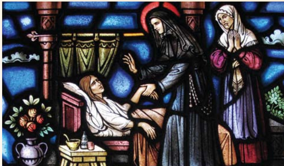
St. Frances Cabrini, stained glass window, St. Jude Catholic Church, NJ.

The life of St. Frances Xavier Cabrini is a remarkable story, one that recalls the great missionary journeys of St. Paul. Just as the Apostle to the Gentiles traveled back and forth on the Mediterranean, establishing churches as he went, so Mother Cabrini crossed and re-crossed the Atlantic, founding schools, orphanages, hospitals and other homes for the poor almost everywhere she set foot. She made 25 sea voyages and opened 67 religious houses in her native Italy, and also in France, Spain, England, Central and South America. Mother Cabrini's hardest work, however, was done in the land she adopted as her own. She became a United States citizen in 1910, and so ranks today as the first American to be named a saint of the Church.