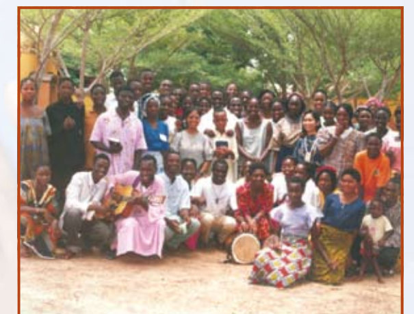
Gathering of Parish Community